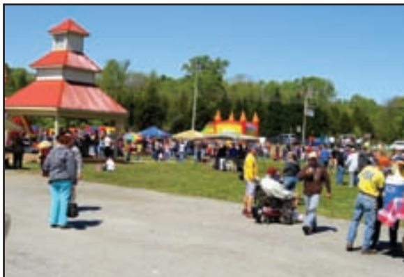
The community gathers at the town courtyard for the Rougemont Easter Festival.