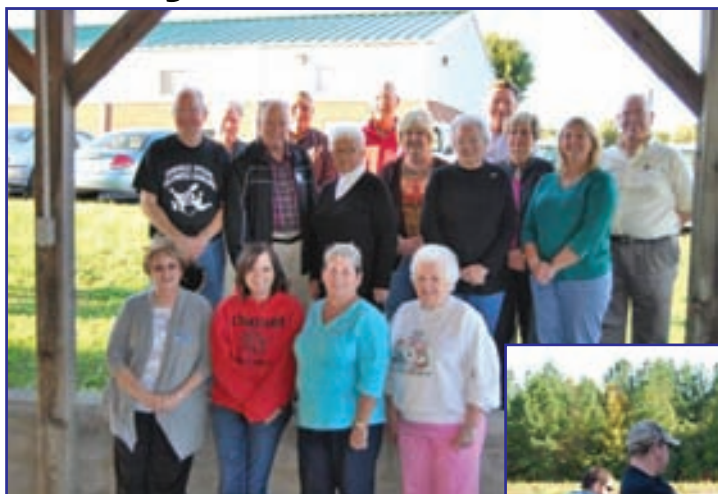
Pictured above are the Dry Fork Ruritan Club members.

Dry Fork (VA) Ruritan Club enjoyed a cook-out in recognition of its 20 th anniversary. A large turnout of members, friends, and county officers made for a nice celebration. Charter members were recognized and deceased members were memorialized.