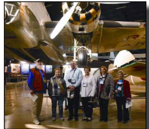
Almost 50 Ruritans took time on Thursday at the National Convention for a trip to travel by bus to Wright - Patterson Air Force Base in Dayton, OH for a field trip to the National Museum of the Air Force there.