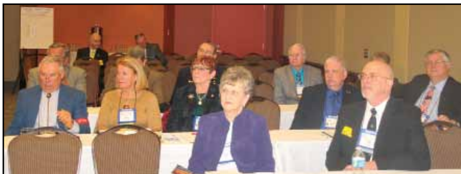
In Branson, newly installed 2014 District Governors participated in a training which included topics such as their legal responsibilities as Ruritan leaders, IRS 990 tax issues, insurance liability for Ruritan clubs, and ways to grow the organization.