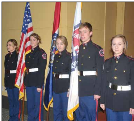
A color guard from the College of the Ozarks High School ROTC program presented the American flag at the 2014 Ruritan National Convention Veterans Breakfast.

Also approved by the delegates was the addition the following, under Section 1. of Article XII: Discipline of Clubs/Members, subsection G. which will read as follows: "Any club which shall be as much as nine (9) months in arrears in the payment of national dues may be temporarily suspended pending action by