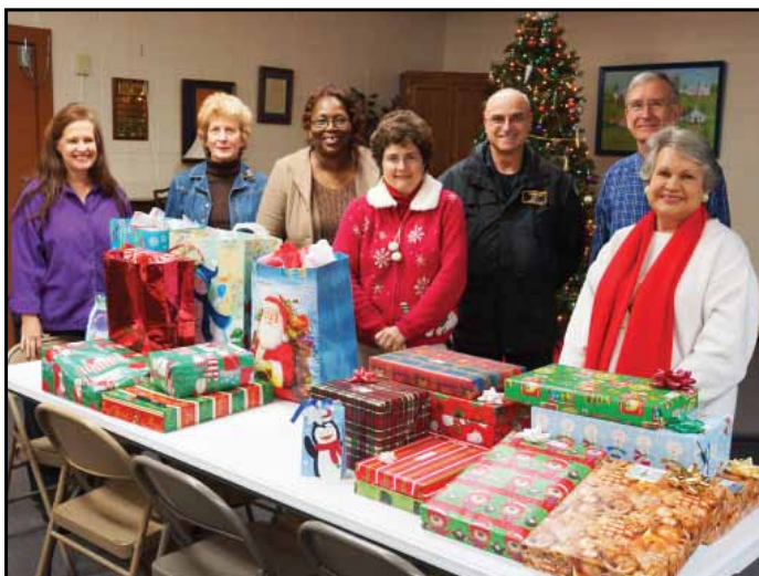
Sandy Run (SC) Ruritan Club made Christmas for three families a lot brighter. Members purchased and delivered clothing and toys. Pictured