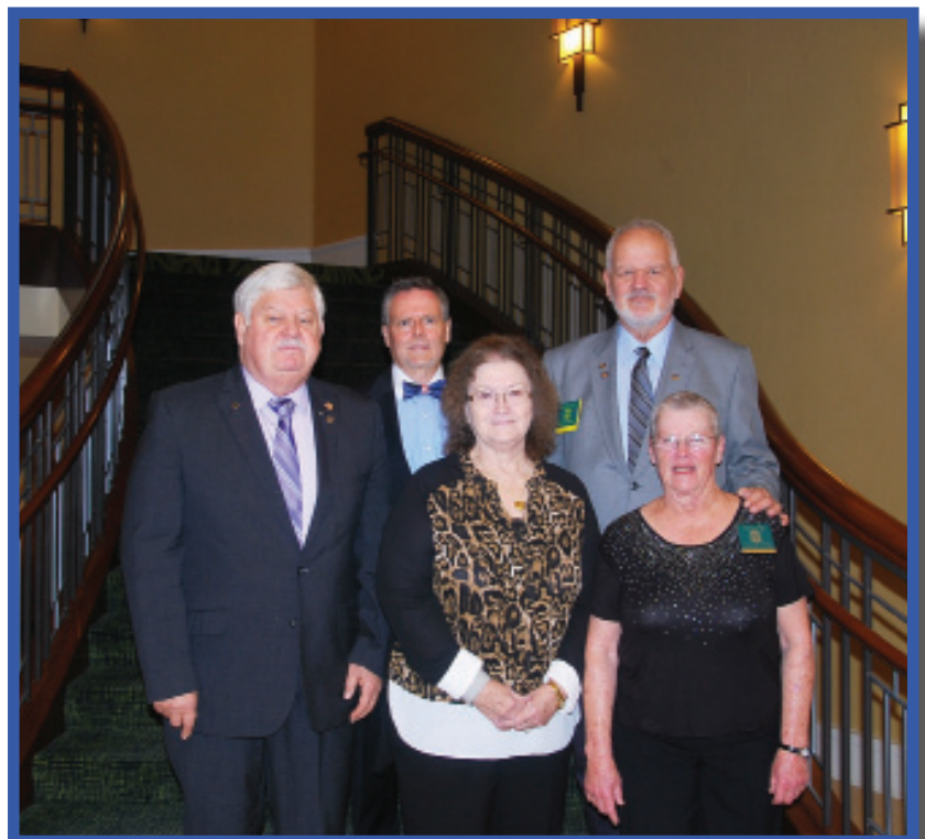
Pictured are the 2017 Ruritan National Foundation Trustees.