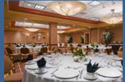
Indoor Pool & Fitness