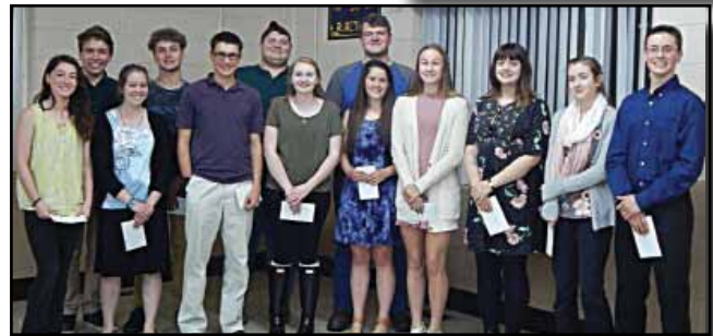
Fort Valley Scholarship Recipients

Fort Valley Ruritan Club held an all-you-can-eat benefit breakfast (donations only) to support the Faith Lutheran Preschool. The breakfast was held at the Fort Valley Fire Hall. Scholarships were given to deserving seniors. Club members held a family picnic where three new members were installed. Other club events included hosting the Fort Valley Community Parade, holding a blood drive, building a handicap ramp, and supporting the Fort Valley Museum's Ice Cream Social.