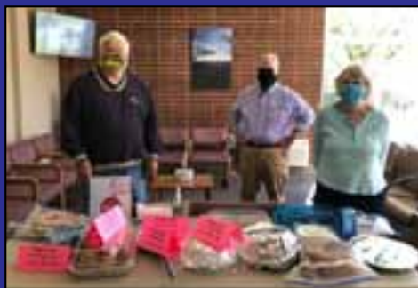
Germanton - Piedmont District donated desserts to Life Brite Hospital Staff.