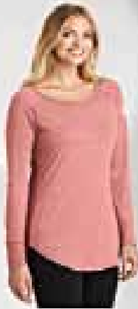
#271 Blush Tunic

Need help placing your order? Call the Ruritan National Office 877-787-8727. We will help you!