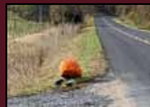
Pleasant View Springhill - Woodrow Wilson District used some of this social distancing time to clean up its community.