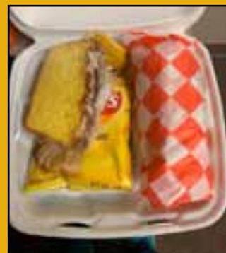
Holy Neck – Holland District donated box lunches to Sentara Obici Hospital Staff.