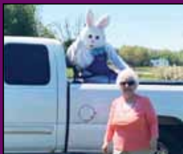
Sandy Ridge - Piedmont District Club spreads a little Easter cheer. Thirty-two children and nine senior adults were left treats.