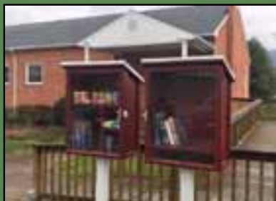
Keezletown – Rockingham District fills its Free Library with non-perishable food items.