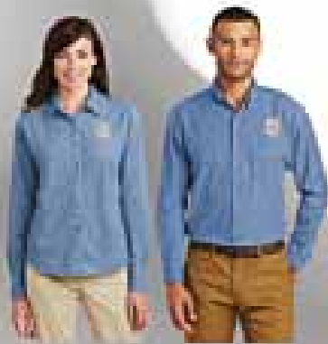
#268 & 269 Port & Company Value Denim Shirt