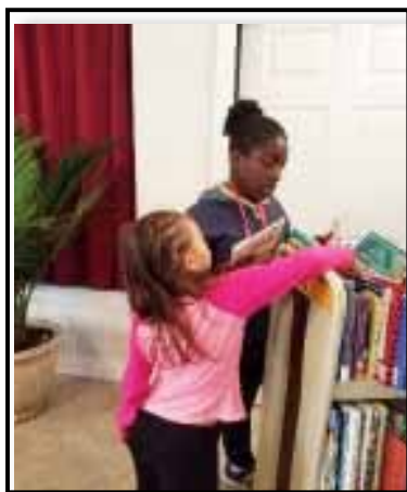
Former SF scholar returns as volunteer teaching assistant.

Lutheran Parish, and Shenandoah County Public Schools have formed this unique partnership as a civic organization, church parish, and school division to serve families, many of whom would not be able to afford such services. An all-volunteer staff of 35 --many who are members of HRC--consists of retired educators, pastors, IT specialists, business professionals, and community leaders whose experiences are both rich and varied. Former students often return to tutor. A therapy dog listens to students read aloud. Highly skilled guest speakers volunteer their time to enrich learning in such areas of