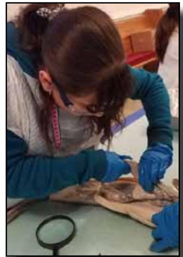
Scholar dissects Dogfish Shark.