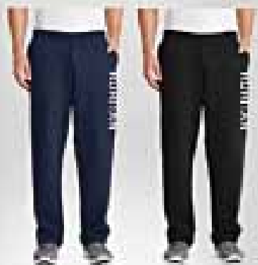
#272 Port & Company Core Fleece Sweatpants with Pockets

With a soft, elegant look, this tunic features rib knit elongated cuffs, longer tunic length, and a curved hem.