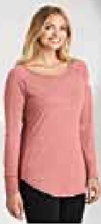
#271 Blush Tunic

Need help placing your order? Call the Ruritan National Office 877-787-8727. We will help you!