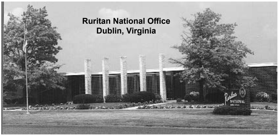
Ruritan National Office Dublin, Virginia